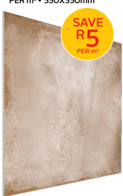
Kilimanjaro Lusitano Cotta EcoTec Matt Floor Tile WAS 129 90 124 90 PER m 2 • 420X420mm