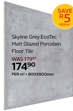
Skyline Grey EcoTec Matt Glazed Porcelain Floor Tile WAS 179 90 174 90 PER m 2 • 800X800mm