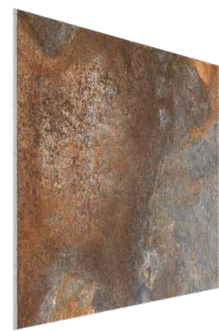
Kilimanjaro Chwaka Slate EcoTec Matt Floor Tile 94 90 PER m 2 • 350X350mm