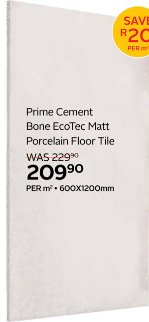
Prime Cement Bone EcoTec Matt Porcelain Floor Tile WAS 229 90 209 90 PER m 2 • 600X1200mm