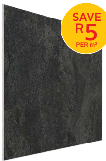
Kilimanjaro Kgalagadi Charcoal EcoTec Matt Floor Tile WAS 109 90 104 90 PER m 2 • 350X350mm