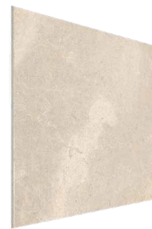
Kilimanjaro Mazoni Ivory EcoTec Matt Floor Tile 84 90 PER m 2 • 350X350mm