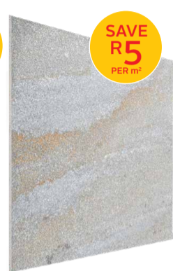
Kilimanjaro Lamu Sand EcoTec Matt Floor Tile WAS 99 90 94 90 PER m 2 • 420X420mm