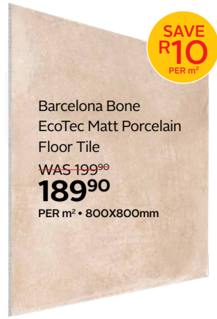
Barcelona Bone EcoTec Matt Porcelain Floor Tile WAS 199 90 189 90 PER m 2 • 800X800mm