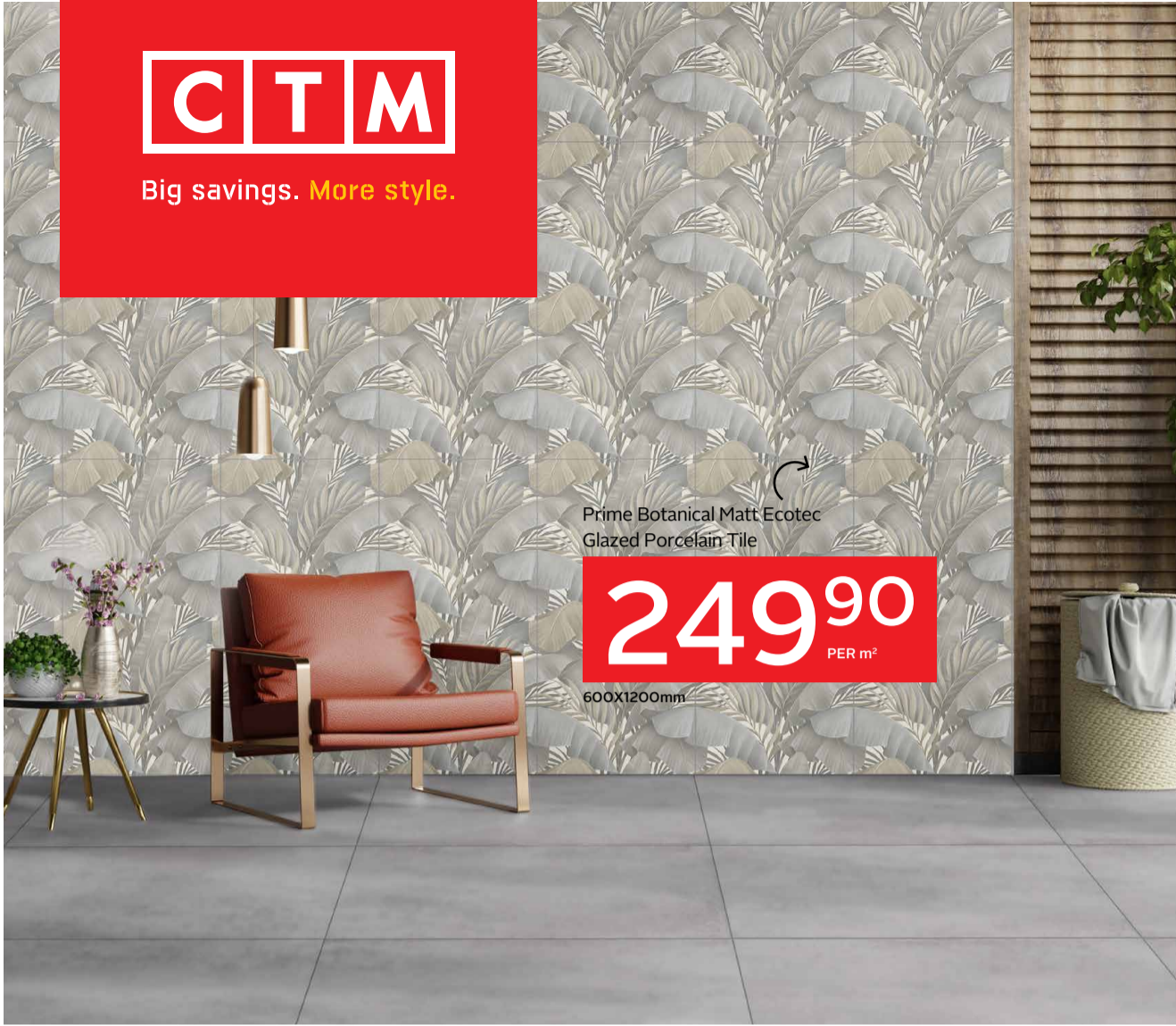
Prime Botanical Matt Ecotec Glazed Porcelain Tile