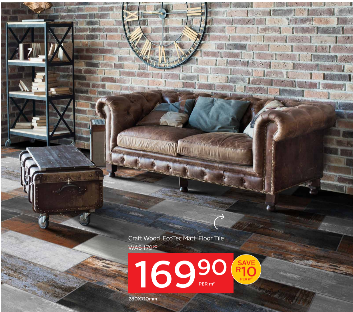
Craft Wood EcoTec Matt Floor Tile WAS 179 90