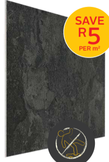
Kilimanjaro Kgalagadi Charcoal EcoTec Slip-Resistant Porcelain Floor Tile WAS 119 90 114 90 PER m 2 • 350X350mm