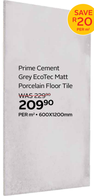
Prime Cement Grey EcoTec Matt Porcelain Floor Tile WAS 229 90 209 90 PER m 2 • 600X1200mm